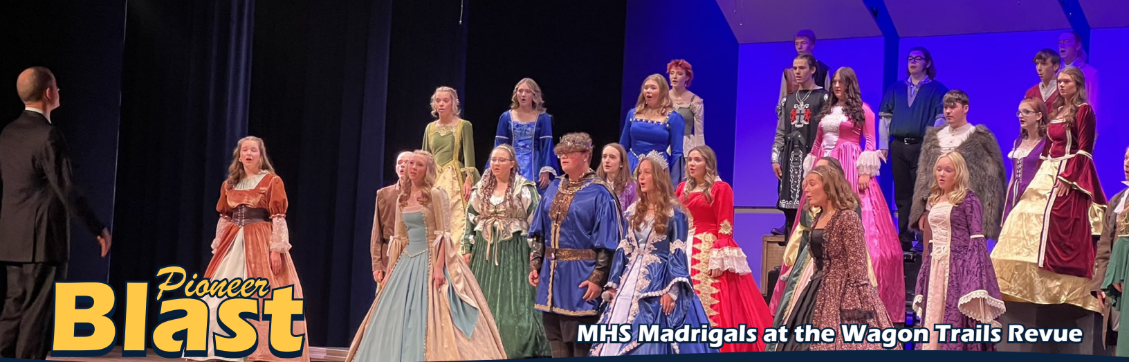
MHS Madrigals at the Wagon Trails Revue