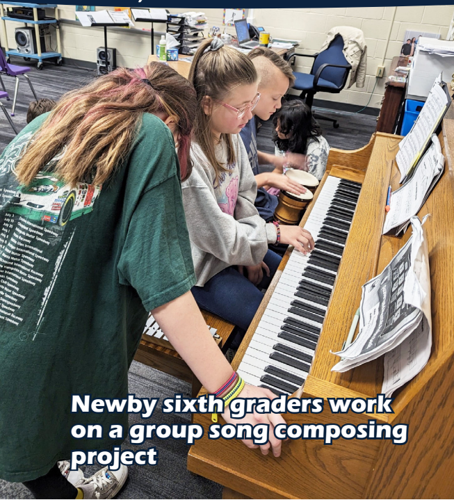
Newby sixth graders work on a group song composing project