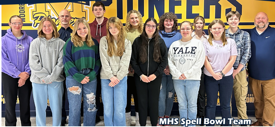
MHS Spell Bowl Team

After a successful season, the MHS Spell Bowl team has advanced to state finals and will compete Nov. 11 at Purdue University. While MHS has had other academic teams at State, this is their first Spell Bowl team at the finals.