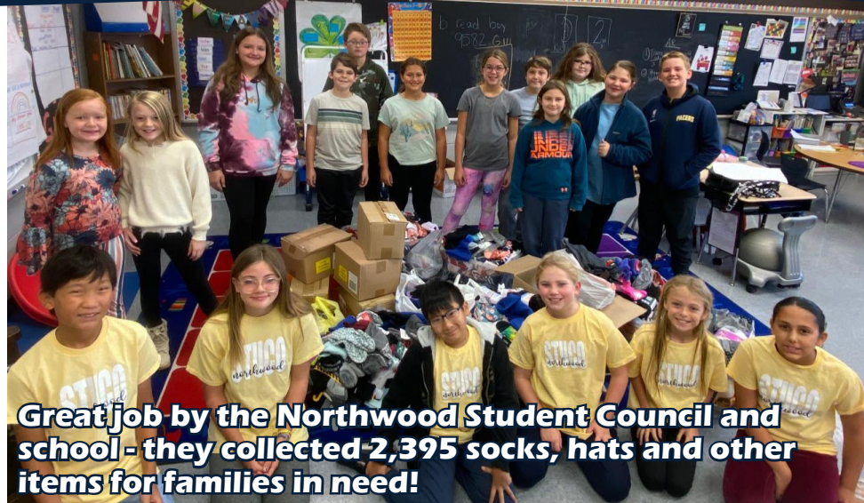
Great job by the Northwood Student Council and school - they collected 2,395 socks, hats and other items for families in need!